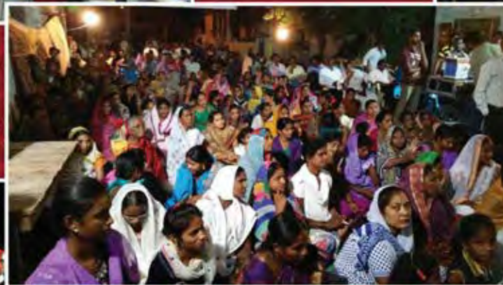
Family and friends attending graduation in Hyderabad.